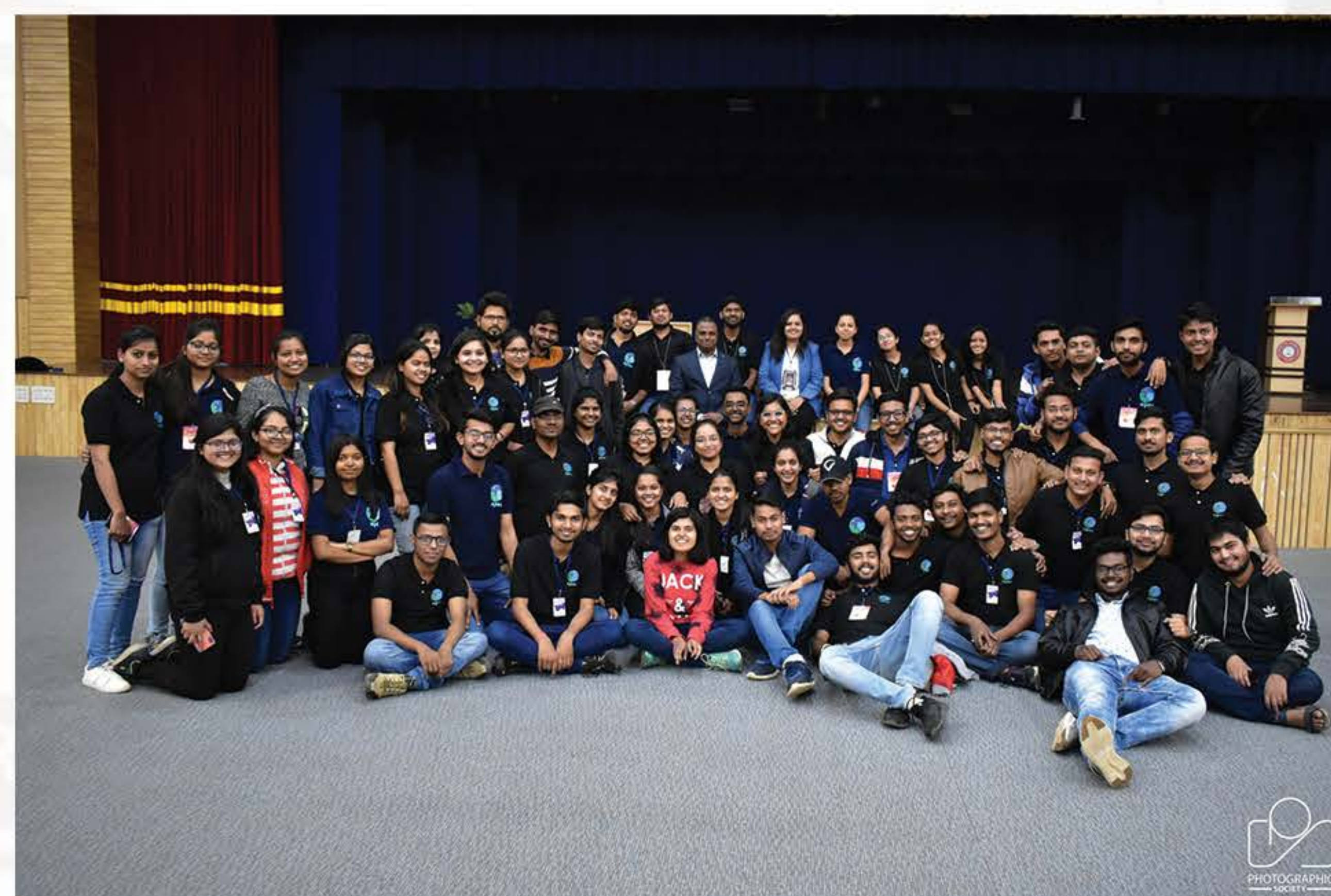
EPAC organising Jharkhand Science & Environmental Fest'20