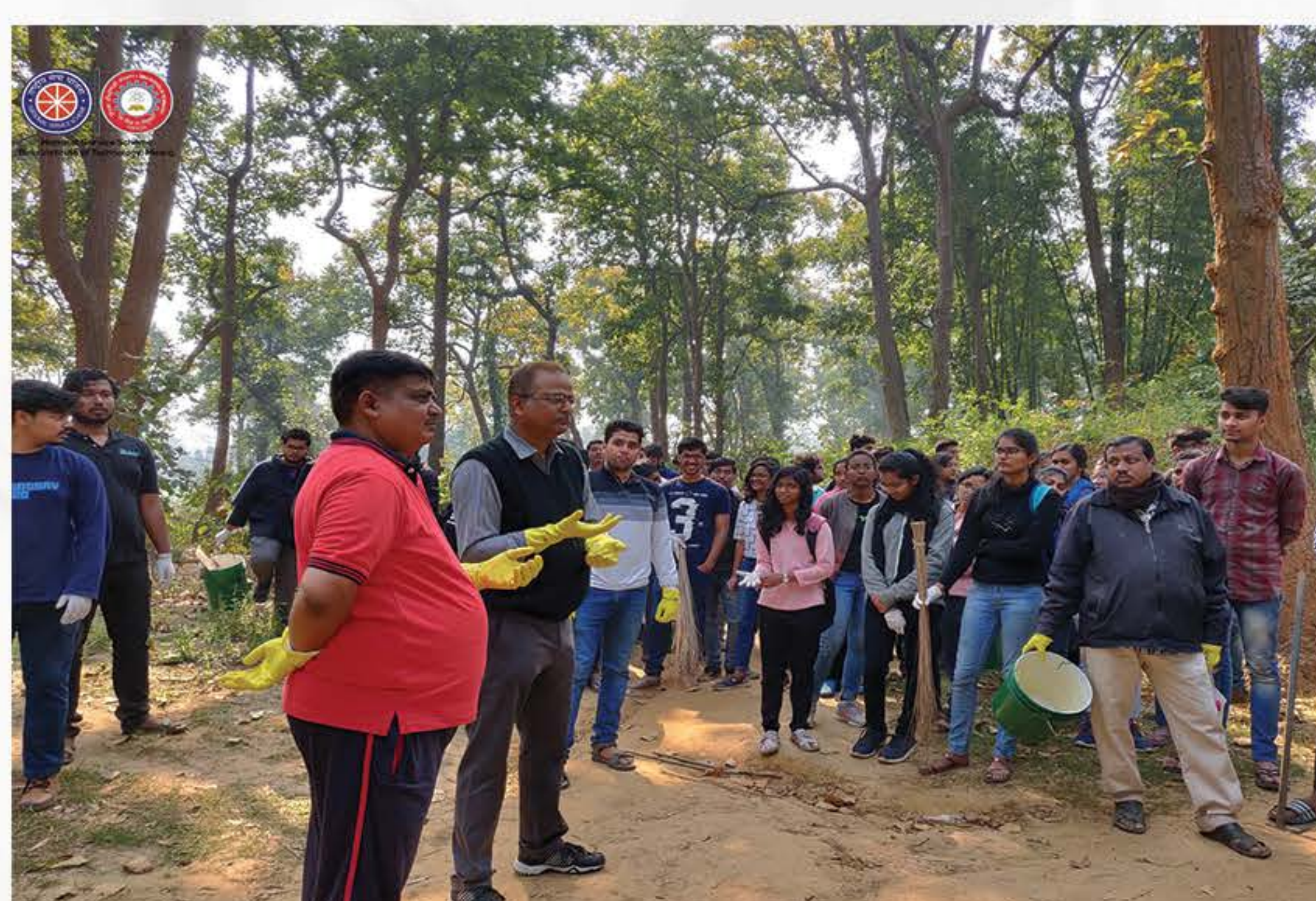
NSS BIT Mesra organizing a river cleanliness drive on the campus.

The National Service Scheme is a public service program conducted by the Ministry of Youth Affairs and Sports of the Government of India. BIT Mesra has a well established NSS cell consisting of around 1000 volunteers who are actively involved in various activities of social cause.