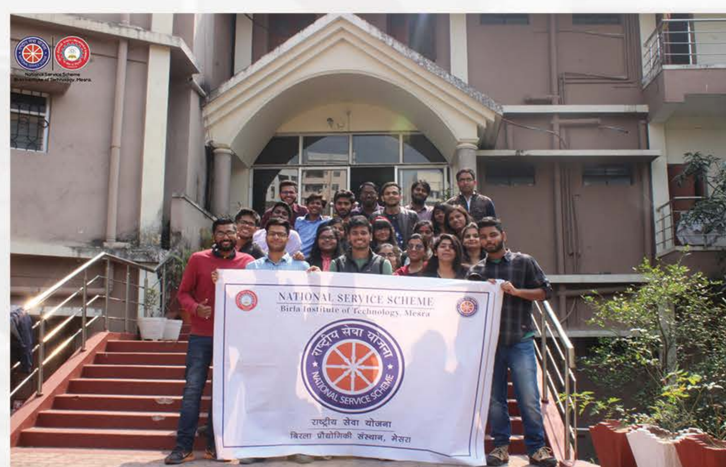
NSS BIT Mesra members visiting an Old Age Home.