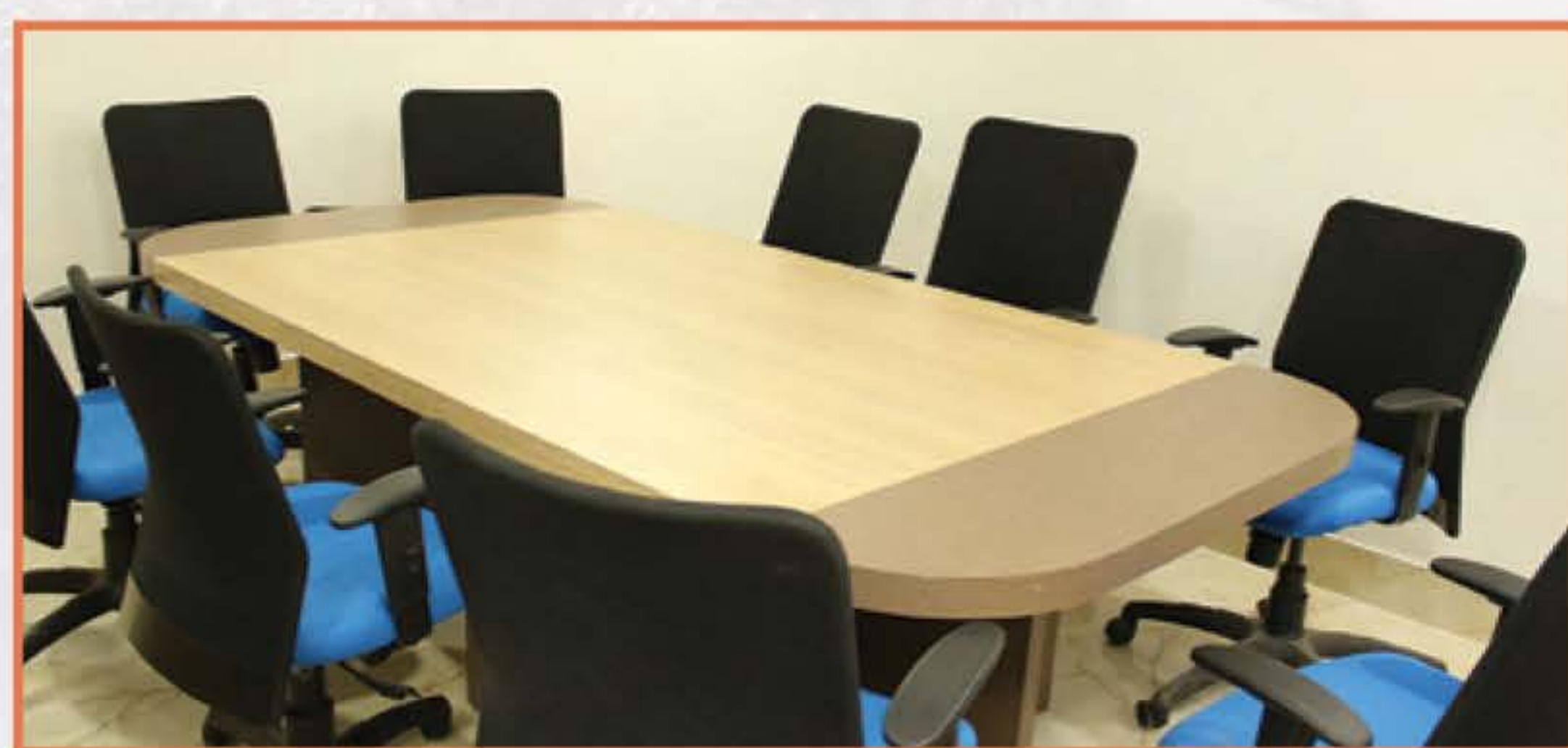
Equipped Conference Rooms