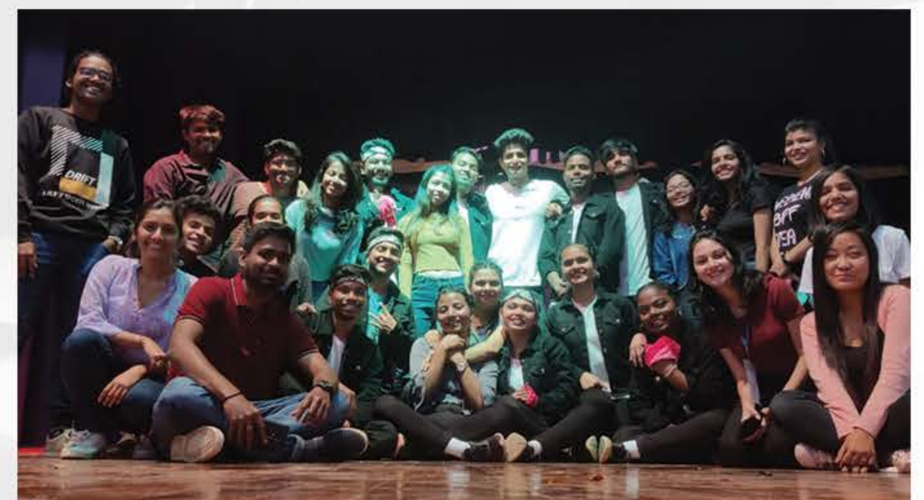
Music & Dance Club