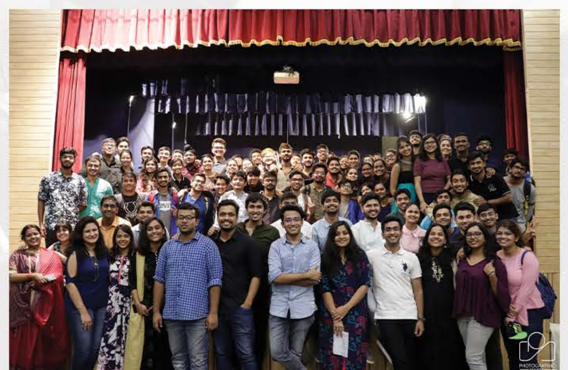
Dramatics Society organising Dramzest