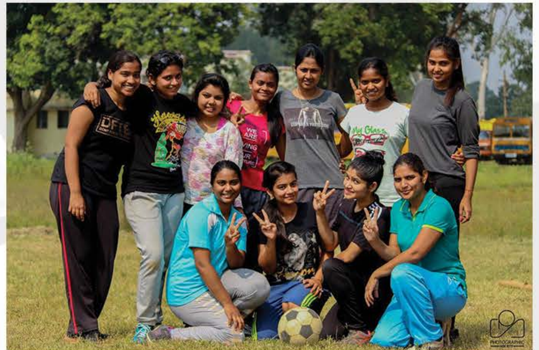
SMAC organising Women's Football Matches in FUTSAL