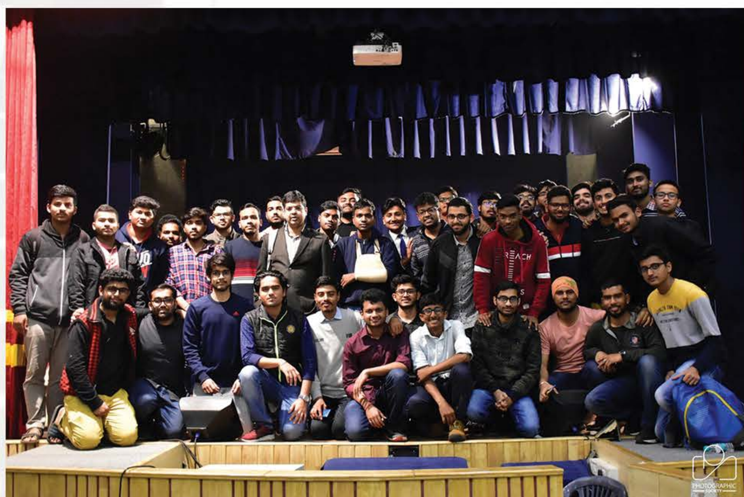
EDC organising E-Summit'20

The club works towards achieving an objective and fulfilling an ideal that is greater than any of us which is saving the environment.