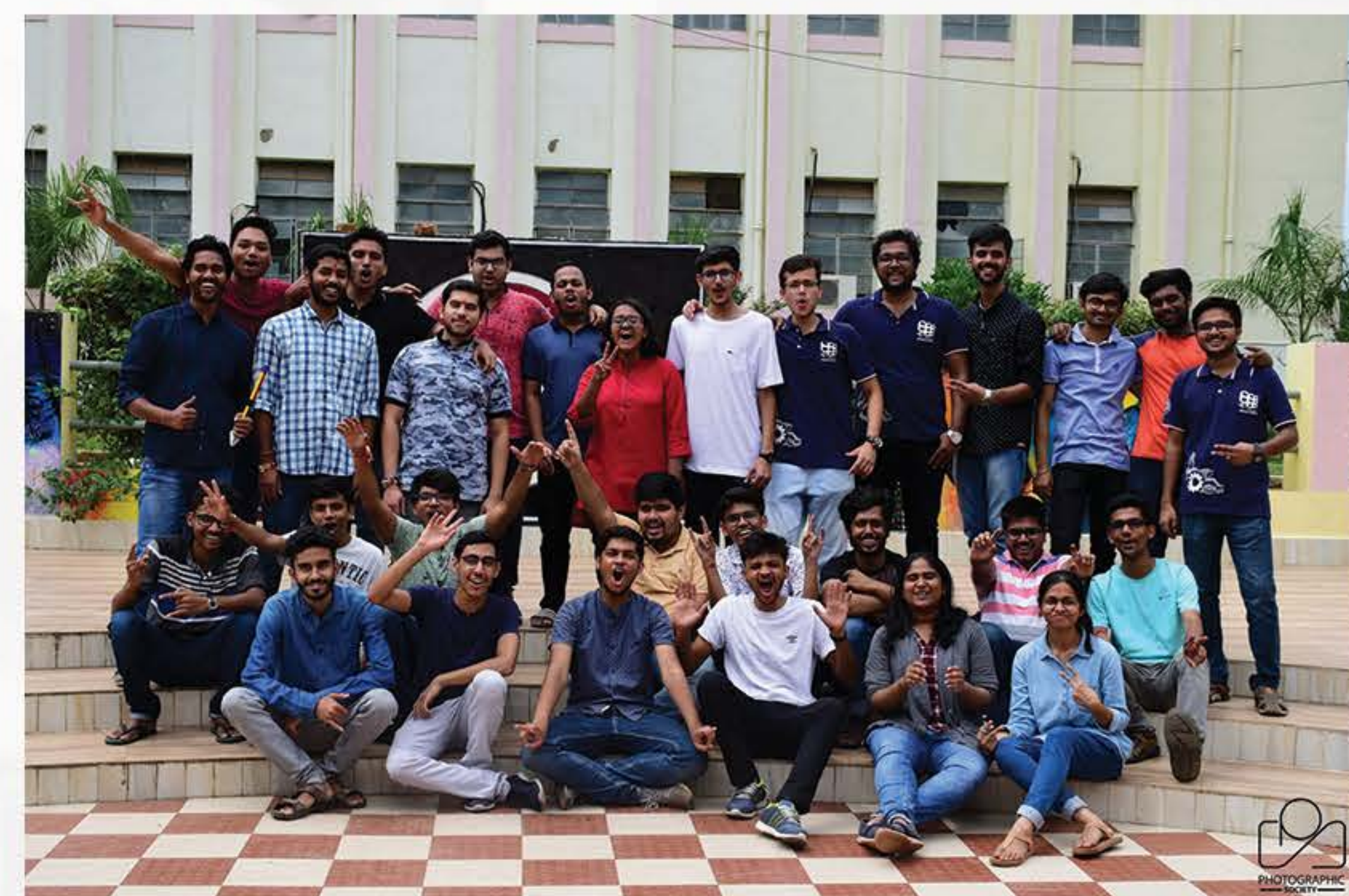
Robolution organising Robotics Exhibition on Independence Day

Team Robolution is a group of ingenious students from different branches, with a common purpose – “Dextering Robotics”. It is the official robotics team of Birla Institute of Technology, Mesra. A part of our team, “Team Pratyumnis” is the official ABU, Robocon participating team of BIT Mesra which is the largest robotics competition in Asia Pacific. Our best rank in ABU-ROBOCON is 9th (out of 90).