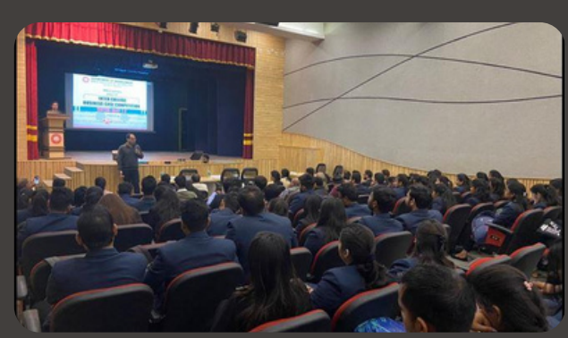
Closed Amphitheatre for Presentations