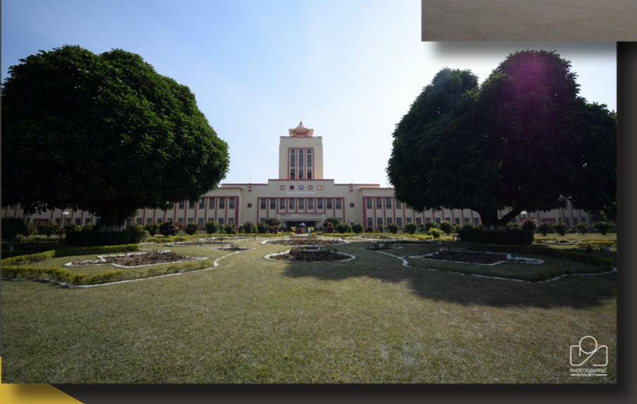
The Main Building