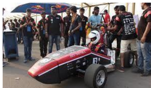
...a, Ranchi, Jharkhand, India