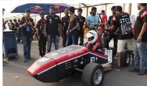
...a, Ranchi, Jharkhand, India