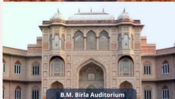
B.M. Birla Auditorium